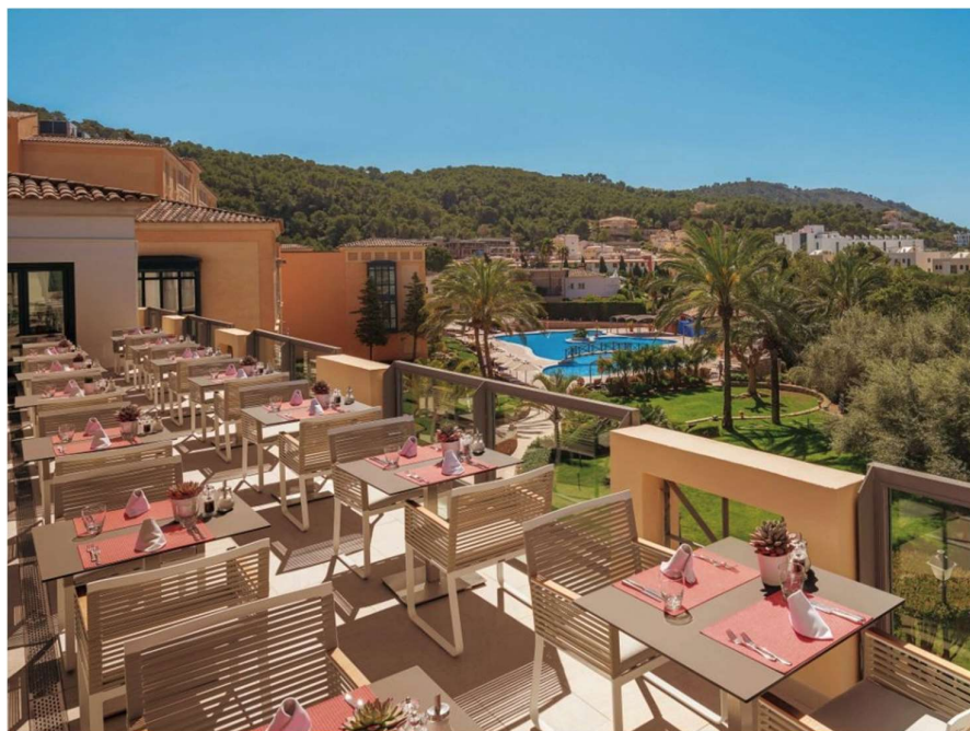
Steigenberger Golf & Spa Resort Camp de Mar